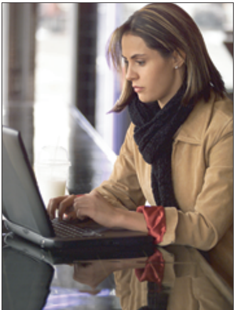
Job Performance by CLIK Ranking

Criterion Validity: The CLIK measures basic computer literacy, and as such has been shown to predict job readiness and in some cases overall job performance for a range of jobs for which basic computer skills are an essential job requirement. For example, for a sample of employees in clerical and administrative positions at a large employer, there was a strong correlation (0.50) between CLIK scores and job performance, as measured by supervisory ratings.